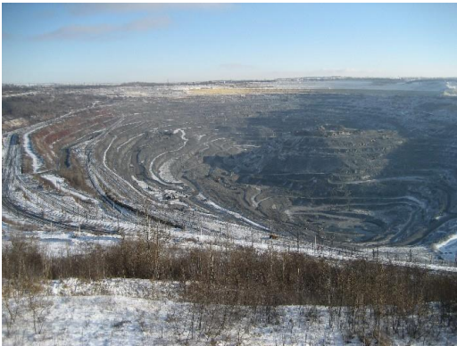
Lebedinsky, Magnetite Mine- Russia