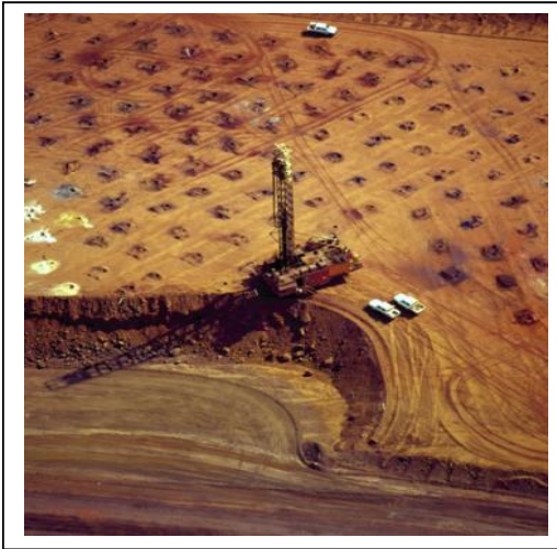
Large Diameter Blast Holes - Pilbara