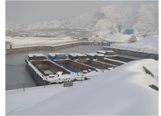
China- Aggregate Quarry Due Diligence & Mine Plans