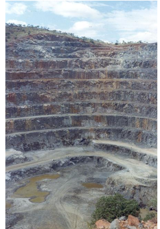
Australian Uranium Mine - Grade Control and Blasting