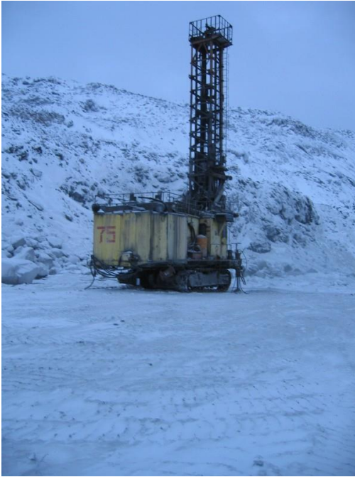
Russia- Magnetite Mine- Drilling and Blasting Review