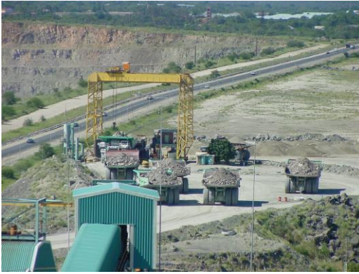
Republic South Africa Phosphate Mine -Due Diligence