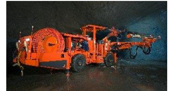
Drill Jumbo - Decline development