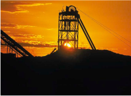
Golden Grove Head Frame - Western Australia