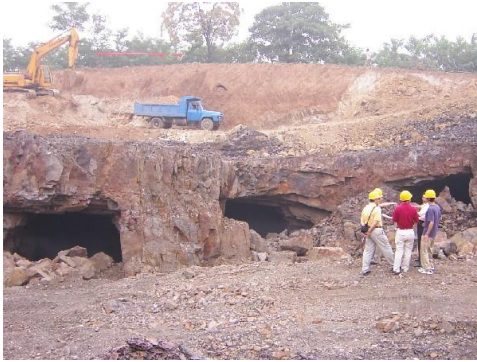
Bauxite Mine - China