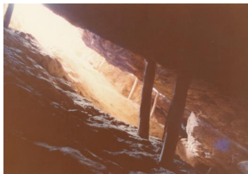
Historic Workings Mt Fisher – Western Australia